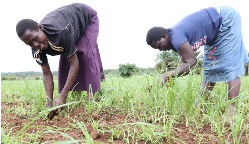
Women work in a farm. Research shows that natural food production are in high demand.

The pyramid illustrates that global food goals cannot be achieved within current broken food systems and ecosystems.