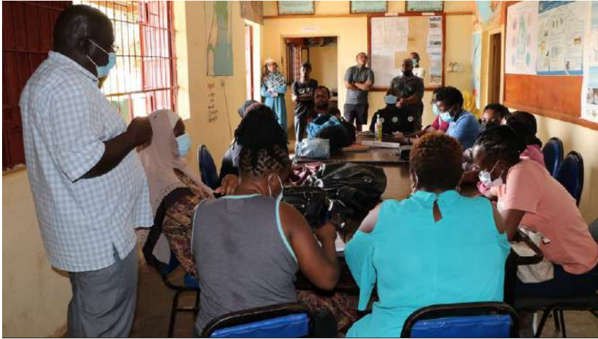
Science journalists during a training on biodiversity.