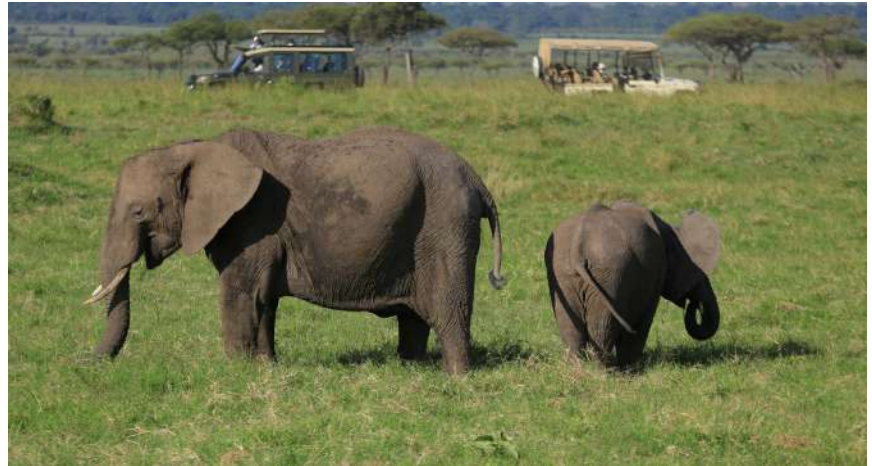
Elephants in the Mara: A new cross border collaborative initiative seeks to conserve the animals in Kenya and Uganda

The collaring exercise saw Kenyan and Ugandan professionals working together, sharing experience and expertise – for a common purpose – something very special to witness.