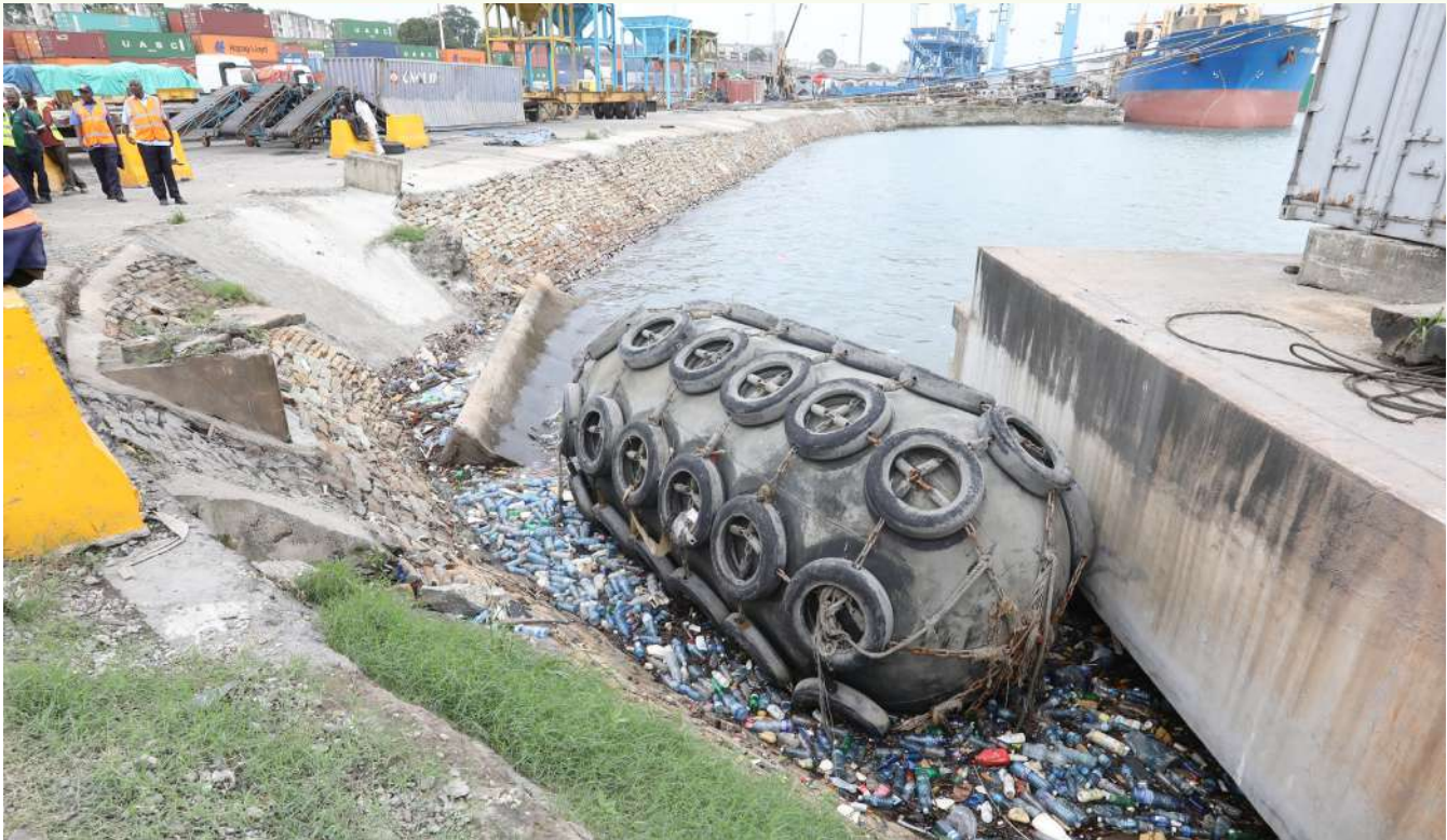
Plastic pollution at the Port of Mombasa. Lots of used plastic bottles find their way into the Indian Ocean daily, affecting biodiversity and the marine ecosystem.

By Bozo Jenje Bozo | bozojenje@yahoo.com