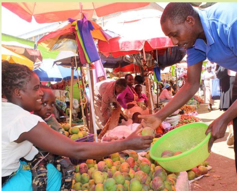
Fruits vendor: Experts recommend consumption of vegetables and fruits more frequently for a balanced and healthy diet.

In the seventh layer there are foods like processed meat like sausages, bacon, salami, associated with a high risk of cardiovascular and other chronic diseases, which should only be eaten occasionally.