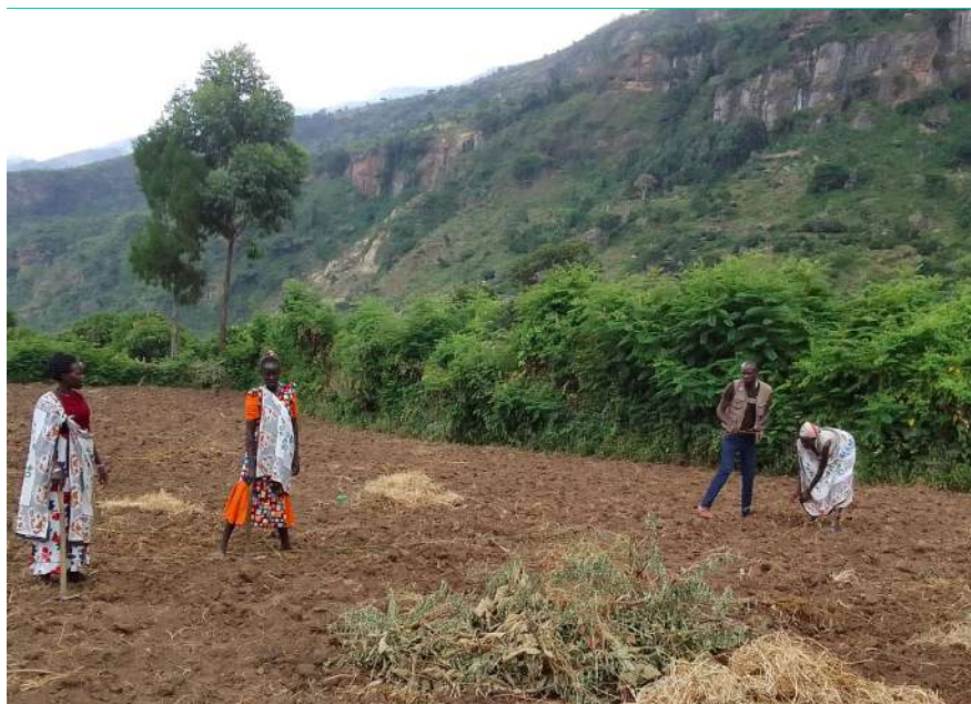
Members of the Chamakagh Mother to Mother Support Group at their watermelon and kitchen garden project in Sigor Sub-county, West Pokot County, Kenya.

Prior to ACF's entry into the matrix, the married women and widows in the group based in Cheptule location were used to rearing livestock and mostly relying on their spouses to provide for their families' needs.