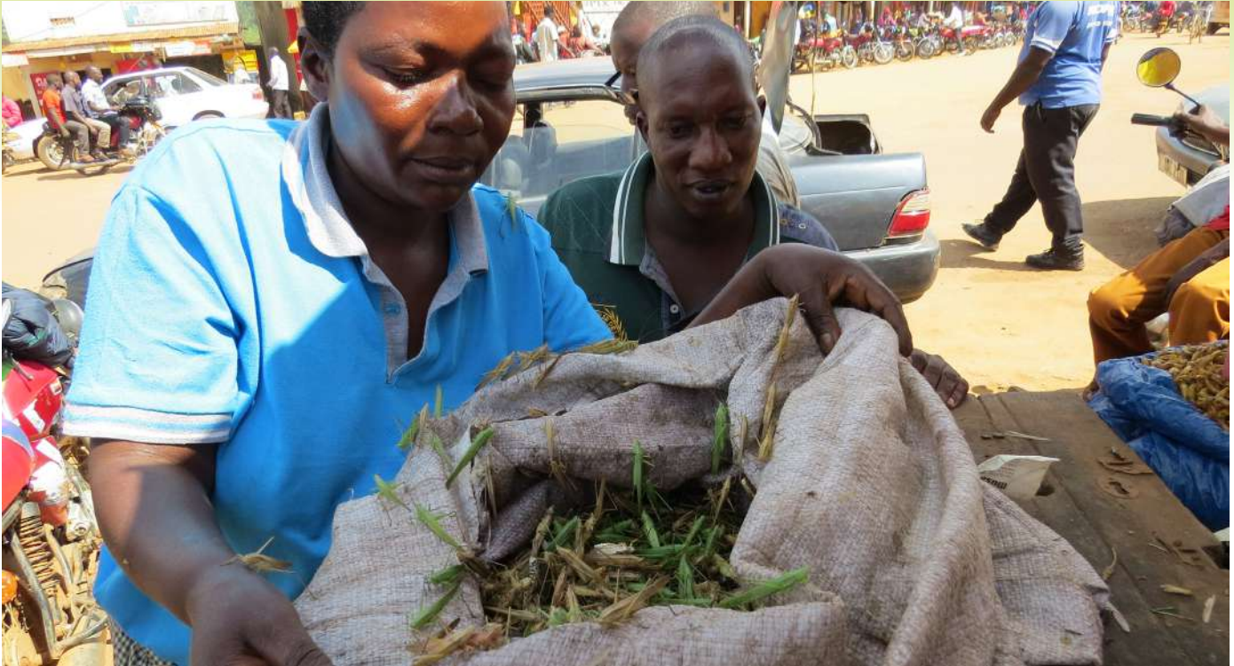
Long-horned grasshoppers harvested from the wild with traditional light traps. Women are largely involved in the processing of these grasshoppers prior to sale.

Our solution to the expanded population's demand for food, Dr Niassy says, is a change in the way we eat by using sustainable and cost effective ecosystem services.