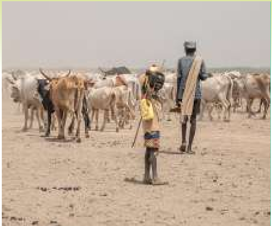
Northern Kenya has suffered the effect of severe drought for the last one year, with the pastoralists losing their only source of livelihood.

"The national and county governments as well as humanitarian organisations are therefore advised to continue with measures that are already being implemented to avert loss of lives, livelihoods and livestock," she said.