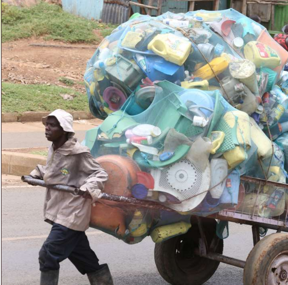
A heap of plastic waste collected for resale and possible recycling.

Kenya followed in 2017 and later by Tanzania in 2019.