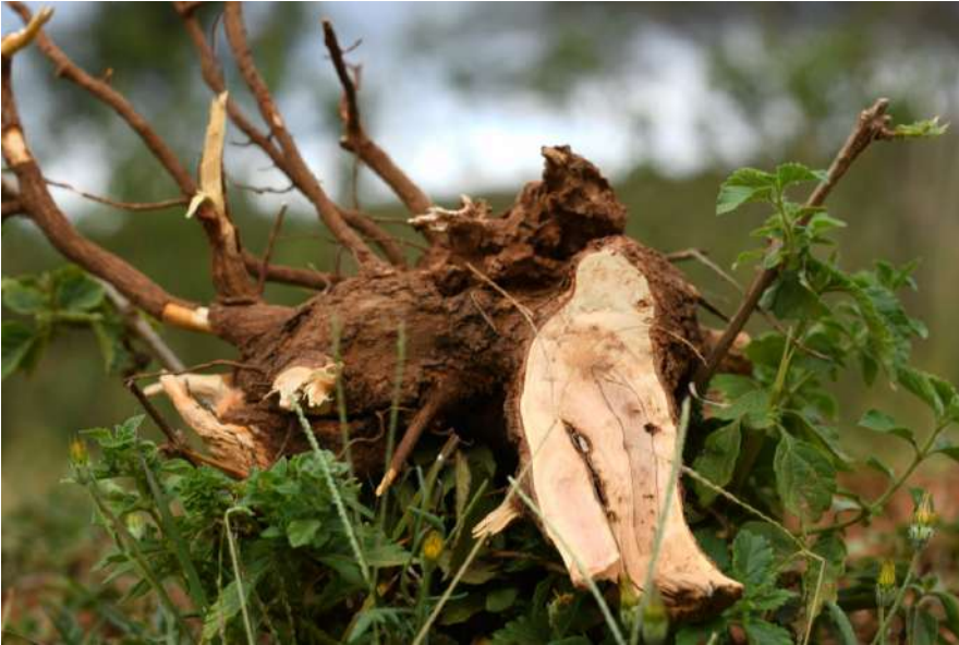
A felled sandalwood tree in Baringo County.