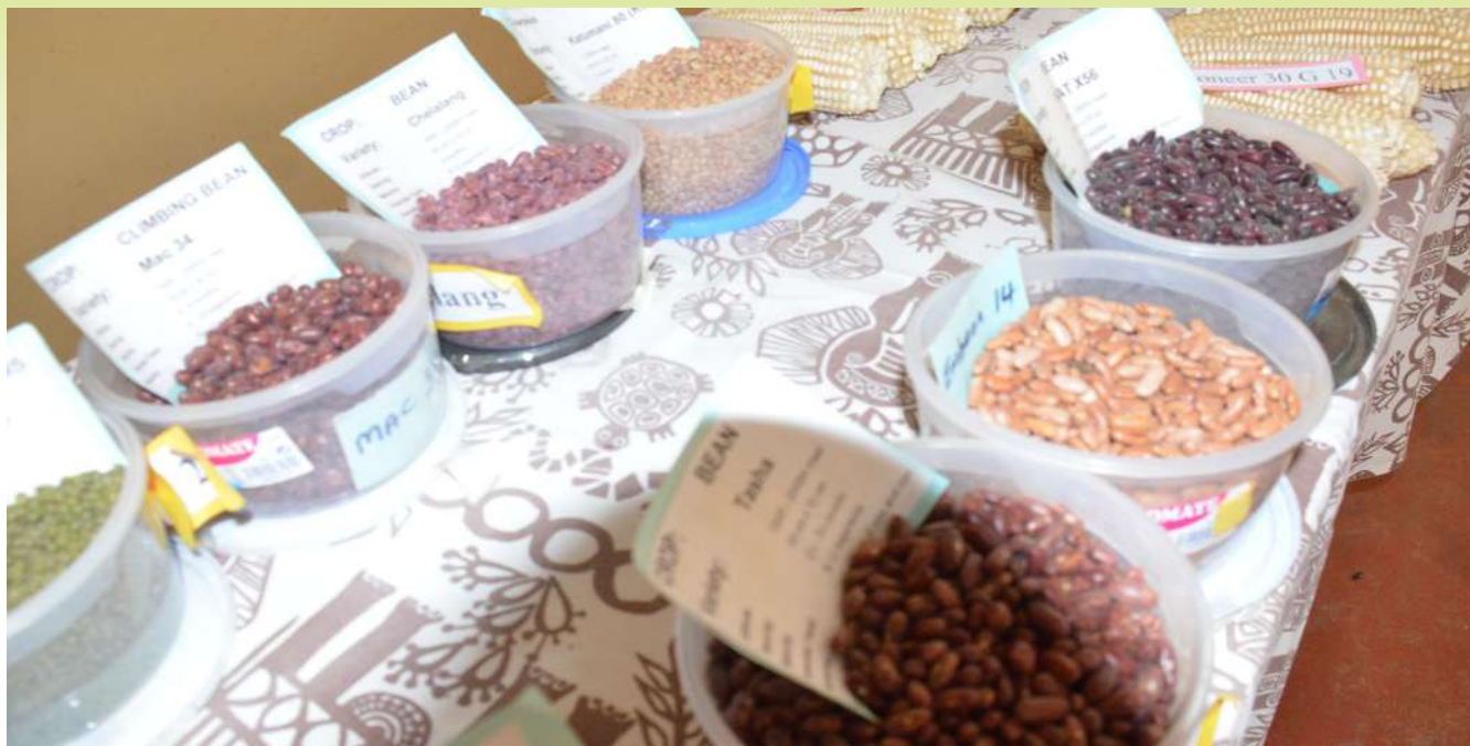
Quality and availability of seeds is a crucial component of supporting smallholder farmers to increase food security in Africa.

Seed sector stakeholders already rely on TASAI country reports as a source of valuable information, but the new dashboard will expand their access and allow for comparisons across time and space that were difficult to do previously,” Dr Mabaya said.