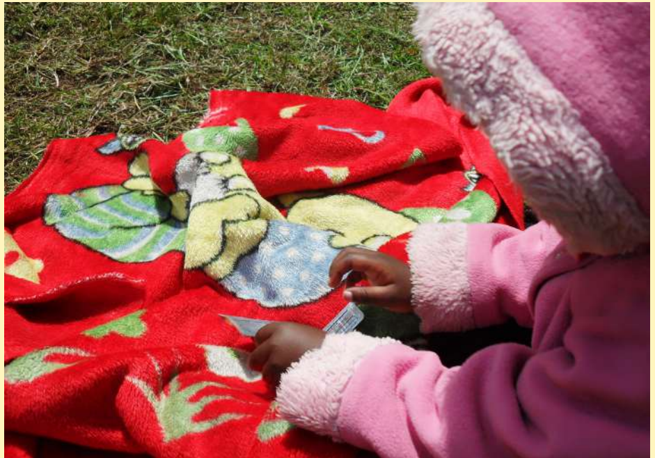
Paediatrics: Viral suppression in the blood is critical to treatment success and significantly reduces child illnesses and death.

"The global community follows UNAIDS visionary goal, 95-95-95, that seeks to end four decades of the most dominant epidemic in living memory," says Libulele.