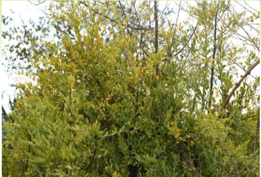
Sandalwood tree in Baringo County.

“Sandalwood in Eastern Africa has also been listed in appendix two of the cities of the increased over exploitation.