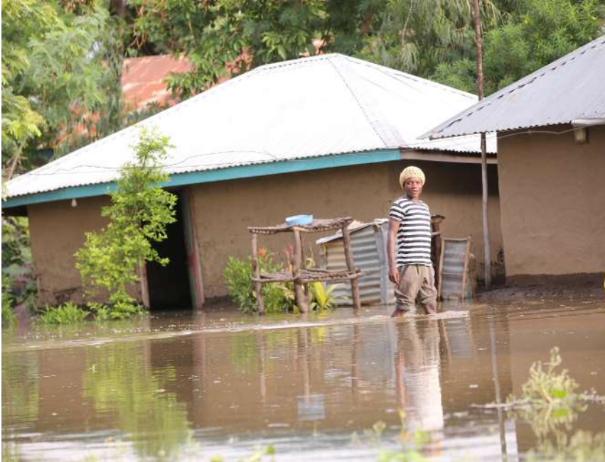
Floods in Budalang'i, western Kenya. There are fears of people and wildlife being displaced as rains begin to pound the country.

By Mike Mwaniki | mikemwaniki2016@gmail.com