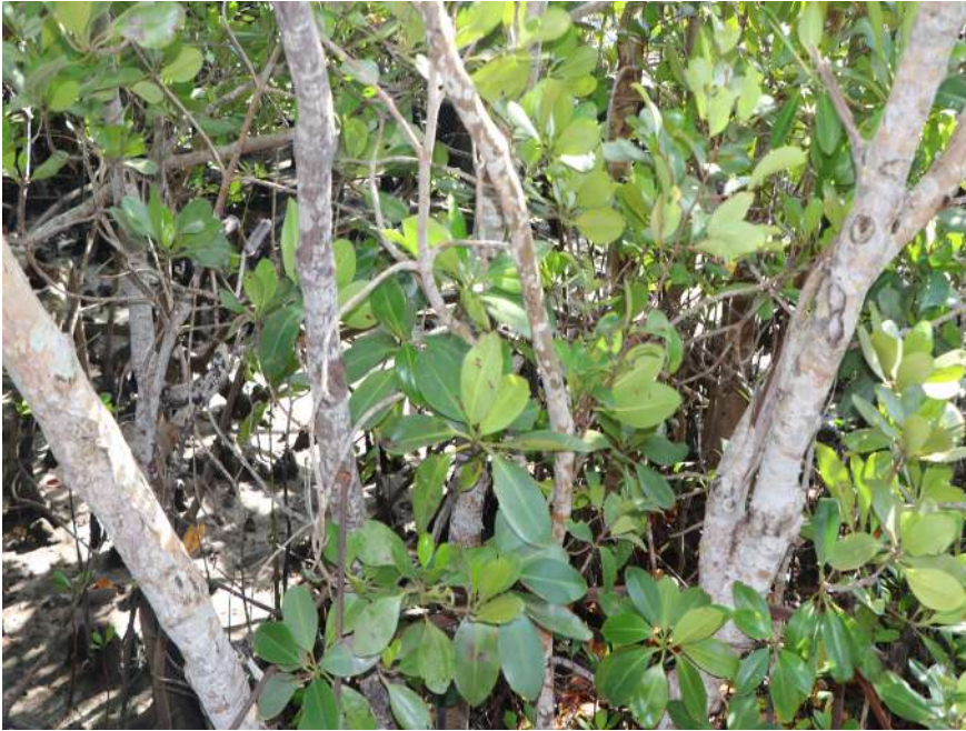
A mangrove forest in Gazi, Kwale County