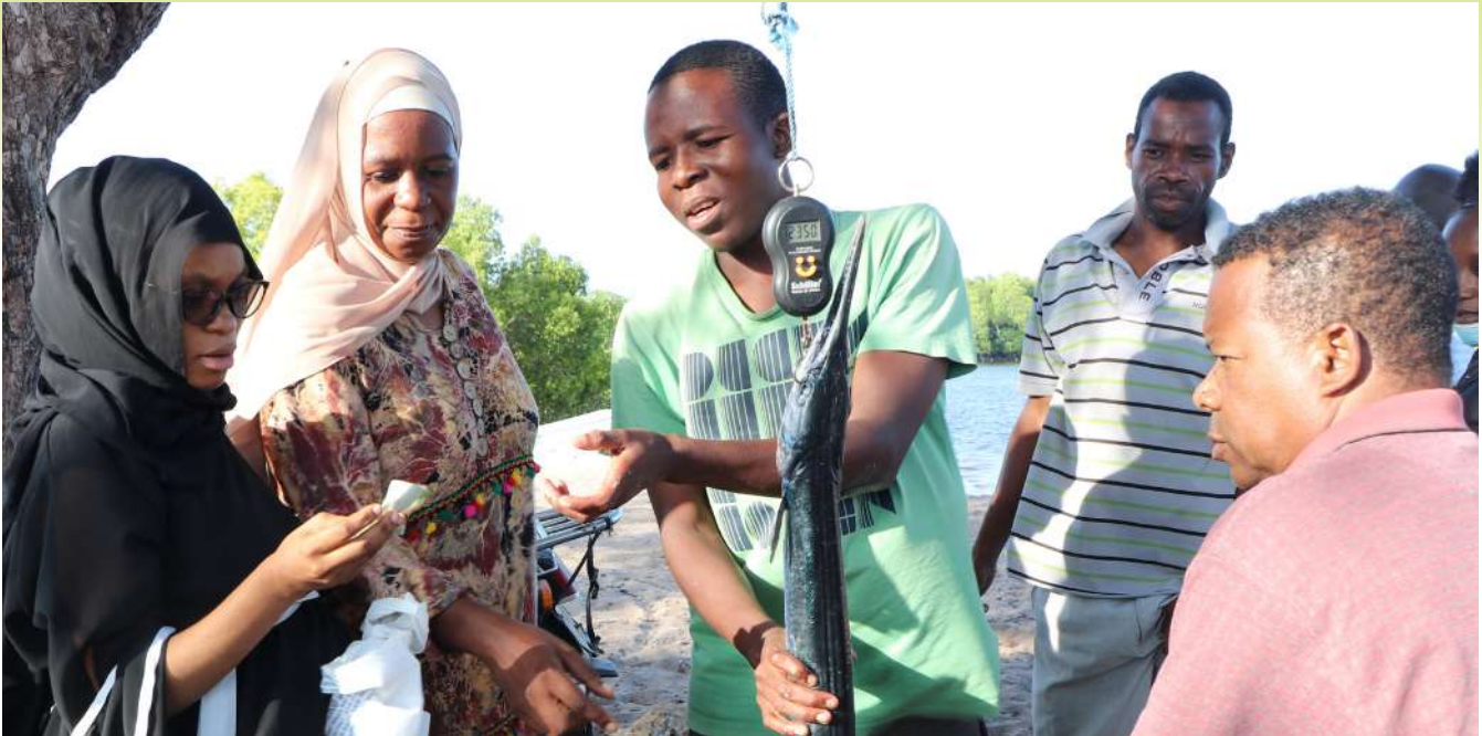
Fisherfolk: Experts say that the lives and livelihoods of people across the continent are heavily dependent on the quality of biodiversity.

“Ecosystem services are the benefits provided by ecosystems that contribute to making human life possible and worth living. Categories of ecosystem services based on their functions include provision of food and medical resources, regulatory services such as bio control, support services such as nutrient cycling and cultural services such as ecotourism,” he explained.